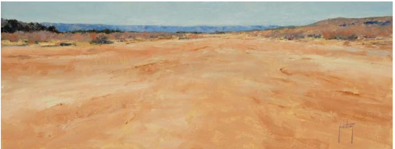
Jerry Ricketson , Prairie Dog Town, Fork of the Red River , oil on canvas, 8 x 20"