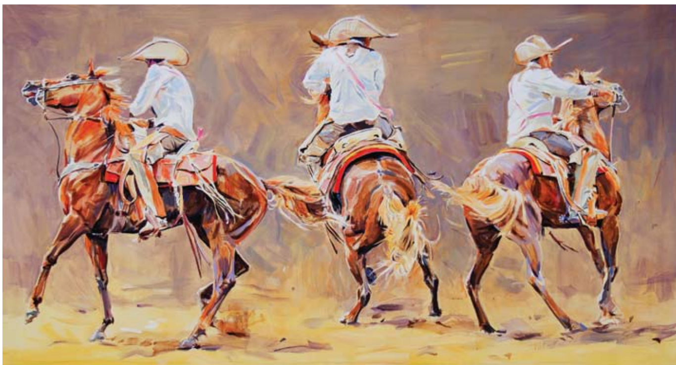
Sophy Brown, The Competitor , acrylic on board, 26½ x 50½"

"In these paintings I am largely looking at a variety of personal situations through the open and unfiltered responses of the horse: always immediate and always visual," explains Brown. "It might be,